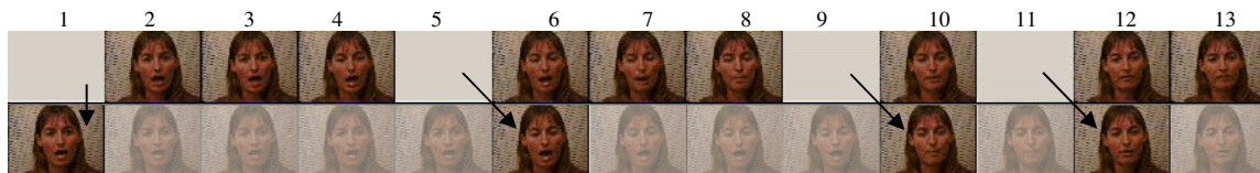
Figure 1: Example of a key frame selection process (bottom row) from a 30fps video (top row)

The picking algorithm is demonstrated in the video sequence in Figure 1 displaying the ‘abab’ part of the stimulus word ‘ababava’. The top row depicts the original 30fps sequence with the frames 1, 5, 9, and 11 cut out and used as the key frames in the key frame sequence in the bottom row. Frame 1 was chosen due to rule 1. Frames 5, 9, and 11 were selected according to rule 2 and were subjected to the 33ms delay in the resulting stream. The light pictures in the key frame row signify the presentation time of the key frames. We emulated the key frame algorithm by creating copies of the key frames and filling up the 30fps grid with them until the next key frame was chosen.